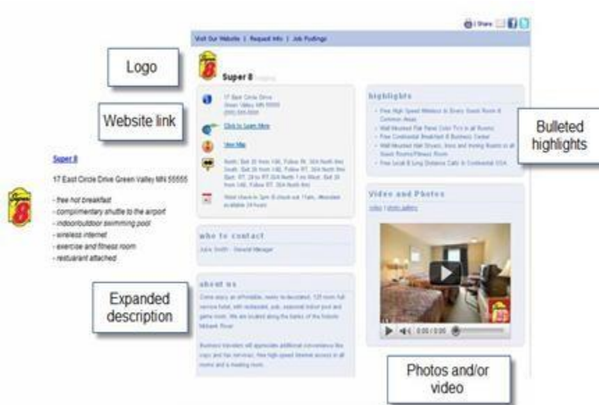
Figure 3 Enhanced listing e-Brochure/Member page